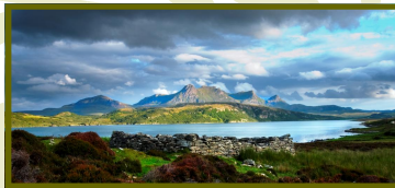
BEN LOYAL THE QUEEN OF SCOTTISH MOUNTAINS

Sutherland is a country pursuits paradise. The Tongue Hotel provides the perfect location and opportunity for the angler to both pursue this passion and also to discuss his hobby enthusiastically in the “Brass Tap”, the hotel's public bar, while enjoying a pint of award winning Caledonian Ale and an excellent range of malt whiskies.