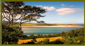
WELCOME TO TONGUE FÁILTE GU TUNGA

The North coast of Scotland is a truly unforgettable experience. With sandy beaches, spectacular sea cliffs and dramatic mountain backdrops,